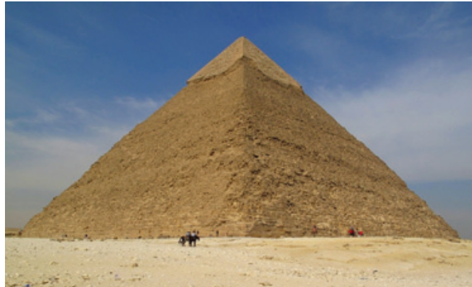
Figure 11. The Great Pyramid at Giza Constructed in 2600 BCE.

Sometime before 2680 B.C.E., when the construction of the Great Pyramid began, the Egyptian astronomers and engineers would have become aware that a Sumerian geodetic pendulum provided a very accurate measurement of the length of an arc-minute of latitude. Using Pendulum 7, to establish the perimeter of the Great Pyramid, provides a perfect match to the measured values with a modest 67 ppm correction for a physical pendulum when it is operated at Luxor. Past claims for a width of 440 Royal Cubits would require a rather small value for the Egyptian Foot as shown in Table 9.