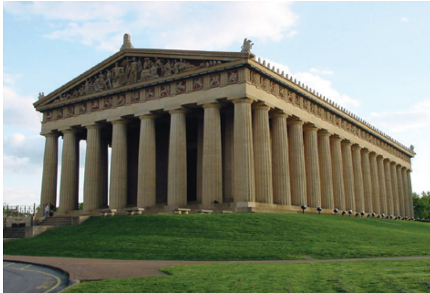
Figure 12. Replica of The Parthenon of Ancient Greece.