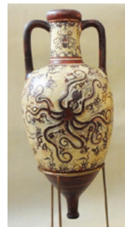
Figure 10. Octopus Amphora