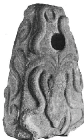
Figure 9. Octopus Weight

four sides or perimeter is 921.421 meters is within 0.25% of 30 arc seconds (1/120 degree) of the Polar Circumference of the Earth established through satellite measurements.